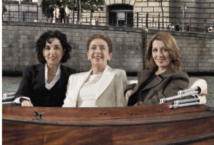
Emine Demirbüken-Wegner, Dr. Lale Akgün, Bilkay Öney